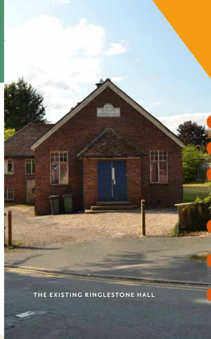
THE EXISTING RINGLESTONE HALL

The local Ringlestone community has been welcomed, received support and had much enjoyment here, but the building is no longer fit for purpose and needs replacing. With a brand new and enlarged centre we will continue the legacy of the local people who gave the land and founded the current Hall. This will increase the capacity for mother and baby groups, children’s activities, music, dance, drama, keep fit, support groups, quizzes, variety shows and church activities and services. Both the existing community and those in the new communities being developed close by will all be able to use the centre.